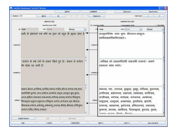
Figure 5: Lexicographer's interface.