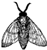
Figure 2: A sample black and white graphic (.eps format) that has been resized with the epsfig command.