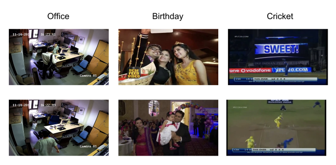
Figure 2. Top Frames based on the Domain specific learnt mixtures

Finally, we look at the top ranked frames based on the learnt mixture for each domain. We see that the the frames intuitively capture the most important aspects for that domain. For example, in office footages, the top frames are frames where people are either entering/leaving or meeting, in Birthday videos, we see a shot where people are taking a selfie and a shot where the birthday girl is posing are ranked the best. Similarly in Cricket, shots where the player is about to hit, and where there is a four being hit are selected. Hence we see that the joint training has learnt specific domain specific importance of events along with the right weights for