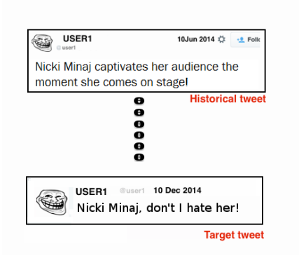
Figure 1: A motivating example for our approach

Similarly, supervised approaches implement sarcasm as a classification task that predicts whether a piece of text is sarcastic or not (Gonzalez-Ibanez et al., 2011; Barbieri et al., 2014; Carvalho et al., 2009). The features used include unigrams, emoticons, etc. Recent work in sarcasm detection deals with a more systematic feature design. Joshi et al. (2015) use a linguistic theory called context incongruity as a basis of feature design, and describe two kinds of features: implicit and explicit incongruity features. Wallace et al. (2015) uses as features beyond the target text as features. These include features from the comments and description of forum theme. In this way, sarcasm detection using ML-based classifiers has proceeded in the direction of improving the feature design, while rule-based sarcasm detection uses rules generated from heuristics.