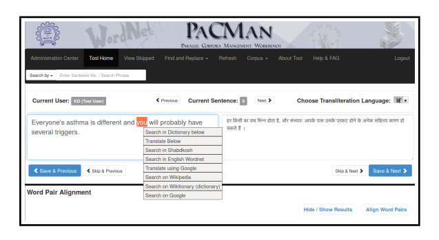
Figure 1: Snapshot of PaCMan on validation / translation screen

systems which are commercially available with features like Translation memory, and Term Extraction.