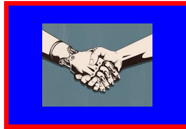
Figure 2: Human Assisted Machine Translator