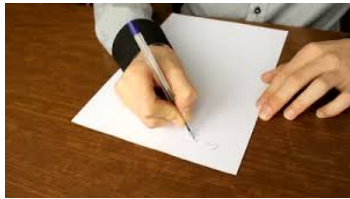
Figure 1: Human Translator