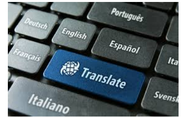
Figure 3: Machine Translation