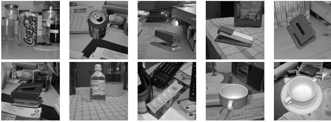
Figure 2: Objects of the data set within heterogenous background: Coke gray, Coke red, stapler green, stapler white, hole punch green, hole punch red, NaCl-bottle, pillbox, cup, cup with saucer.

sample set C_n = \{c_1^n, \dots, c_K^n\} to approximate the multimodal probability distribution in equation (1). Please note that we do not only have a continuous state space for q_n but a mixed discrete/continuous state space for object class and pose as mentioned at the beginning of this section. The practical procedure of applying the CONDENSATION to the fusion problem is illustrated in the next section.