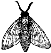
Figure 2: A sample black and white graphic that has been resized with the includegraphics command.

“floating” placement of tables, use the environment figure* to enclose the figure and its caption. and don’t forget to end the environment with figure* , not figure !