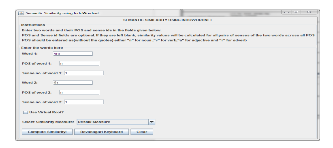
Figure 1: IndoWordNet::Similarity Tool